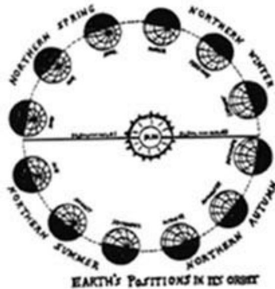
EARTH'S PARTITIONS IN ITS ORBIT

MARCH 21 st and SEPTEMBER 23 rd have days and nights of EQUAL length. Equal nights!