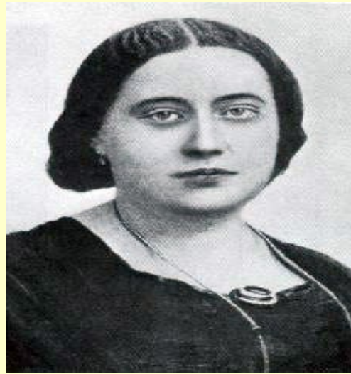
H.P. Blavatsky ,1887, London, "Maycot"