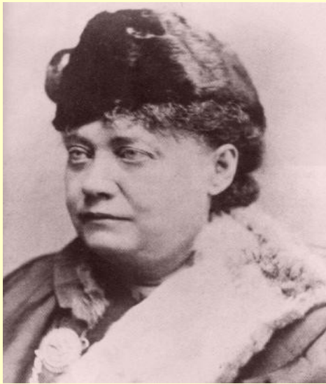
HP Blavatsky 1878